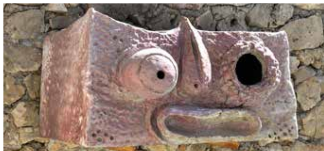
Personnage (Character), ceramic, 1968

In accordance with the law No. 2018-493 of 20 June 2018, promulgated on 21 June 2018, relating to Information Technology, Files and Liberties, you have the right to access and rectify personal data about you that are subject to processing on behalf of the Fondation Maeght.