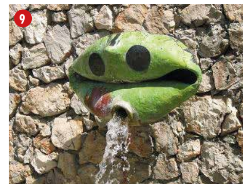
Gargouille, (Gargoyle), ceramic, 1963

For all Joan Miró's works