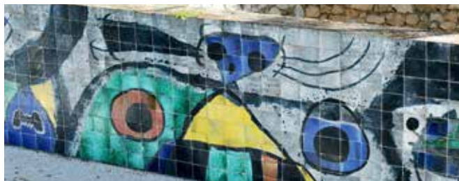
Ceramic wall (detail), 1963

Taxpayers subject to property wealth tax may benefit from a reduction in their PWT in the case of donations to certain non-profit-making public-interest organisations and foundations recognised as being of public benefit. This PWT reduction is equal to 75% of the amount of their payments and is capped at € 50,000. Donations made in the year preceding the year of taxation are eligible for the PWT reduction.