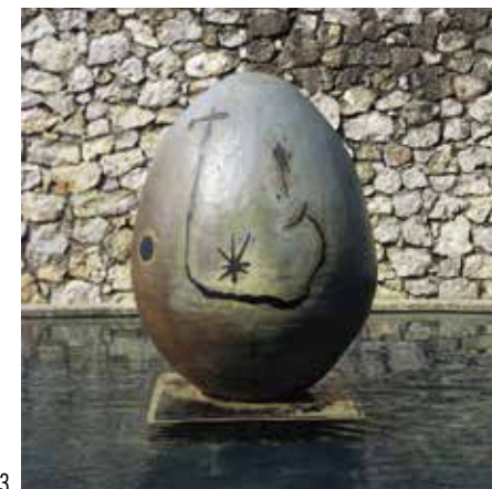
L'Œuf (The Egg), ceramic, 1963

*The “Active” card of the Société des Amis de la Fondation Maeght offers a pass for 1 person for a period of one year. If he or she is already a member, he or she will be able to offer it to a relative.