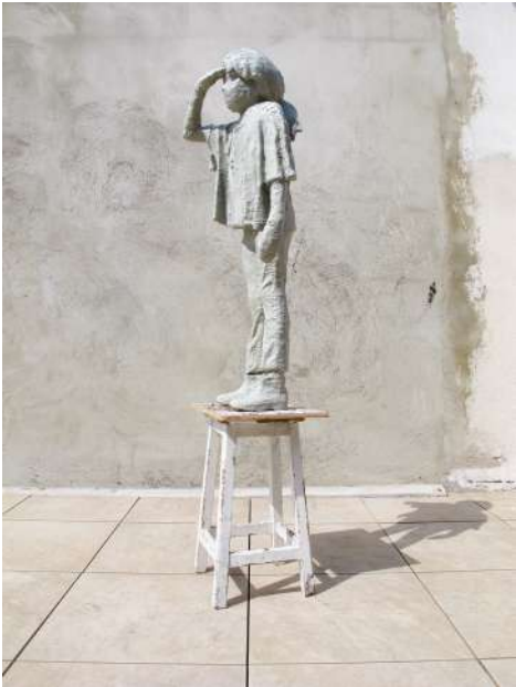
Karim Ghelloussi Sans-titre (La chase aux lézards) 2019 Résine & matériaux divers 180 x 40 x 40 cm