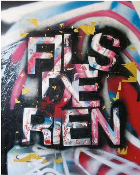
Karim Ghelloussi Fils De Rien 2018 95 x 77,5cm