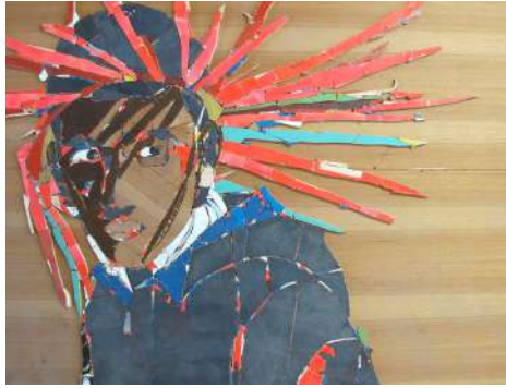
Karim Ghelloussi Le gars de Tébessa (Mémoire de la jungle) 2019 Chute de bois 146 x 175 x 4 cm